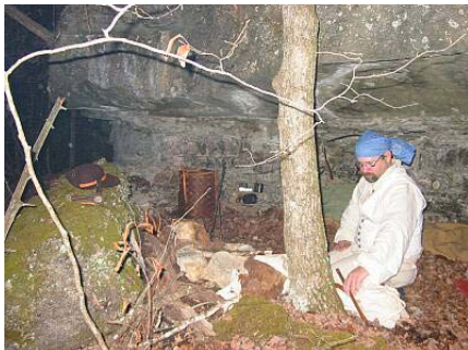
Minding the Tea