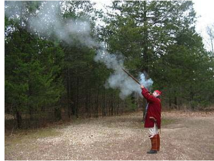
Clearing my gun at the trail head, no squirrels found.